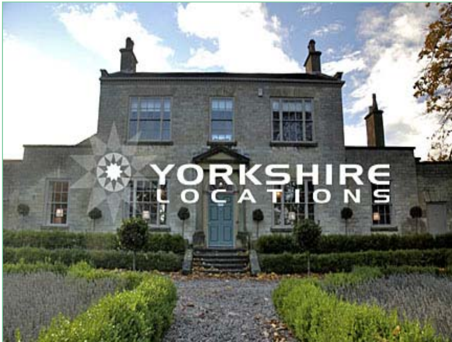
Type: Detached Leeds Ref: 1116 View online